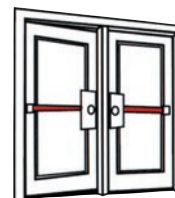
Pairs of Doors with Center Mullions

Pairs of this style should be treated as two single exit doors. Use two locks for maximum safety and security.